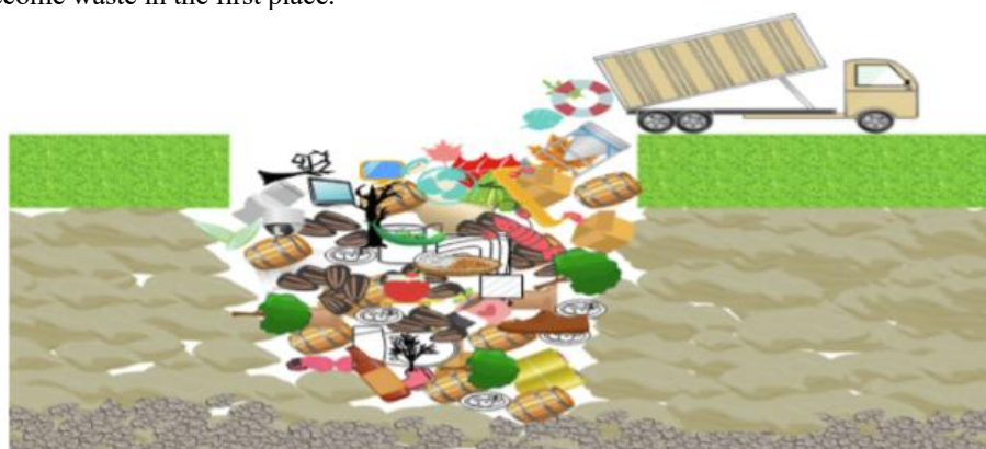
Figure 1. E-Waste landfilling.