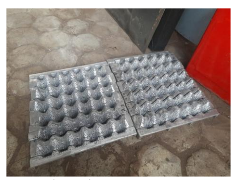
Figure 4: Egg Tray Mould