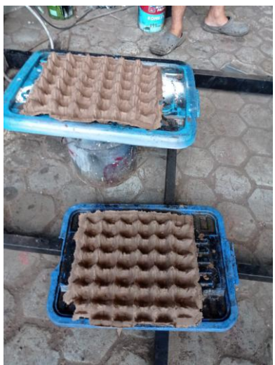
Figure 6: Egg Tray Moulding