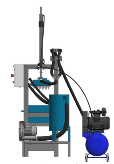
Figure 3: Egg Tray Molding Machine Design (Right View)