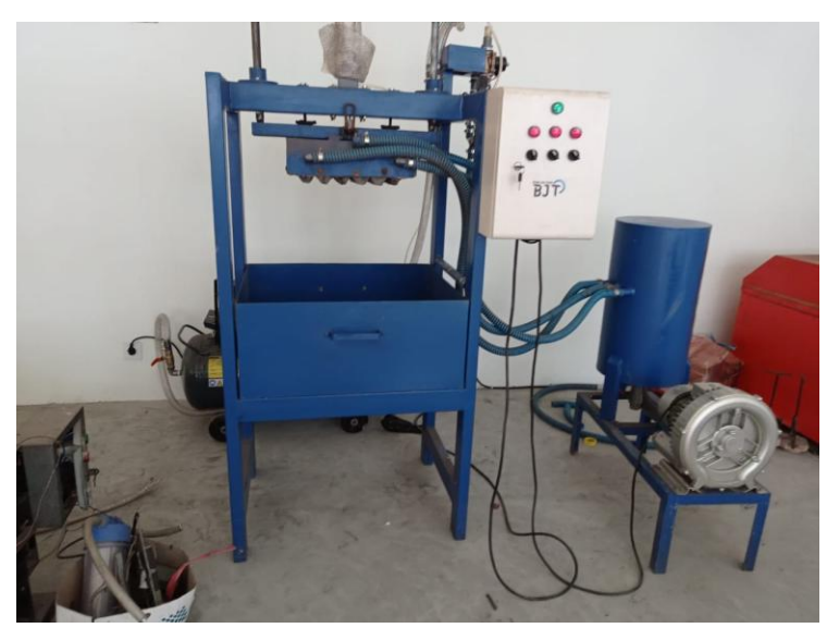
Figure 5: Egg Tray Moulding Machine