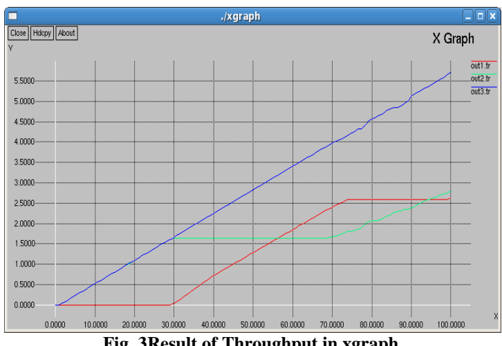
Fig. 3Result of Throughput in xgraph

In credit base system, all the nodes are initialized within the initial credit. Initially credit is same for all the nodes and all the nodes are treated equally. Then based on whether they are forwarding packets successfully or not, credit is increased or decreased. If a packet comes to a node and the node is transferring the packet successfully, then it's credit will be increased else the credit will be decreased, considering node's selfish behavior. The node will not be ignored just based on one unsuccessful transmission, but its behavior will be observed for some time, till its credit goes under threshold value. Once the credit will go under threshold value, that node will be ignored and next packets will not be given to it for forwarding.