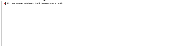
Fig. 4: WiMAX Network Deployment Scheme

The network deployment scheme of fixed WiMAX (IEEE Std. 802.16d-2004) in Figure 4 shows the interconnections between each entity of network with Network Management System (NMS). This kind of structure is a common possible approach of a fixed WiMAX deployment scenario. NMS is installed in a separated machine outside the WiMAX network to accomplish network monitoring and traffic recording. Once all connections are ready, network management can be carried out [20].