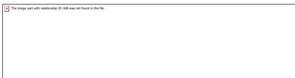
Fig. 2: WiMAX Subscribers by Regions, (2008 – 2010)

According to telecom data published on 5 th of August 2010, it was reported that Asia-Pacific region has overtaken North America as the home to the largest number 4G broadband wireless subscribers. In addition, TeleGeography's 4G Research Service figured that there were around 1.7 million pre-WiMAX and WiMAX customers in Asia at the end of March 2010 compared to 1.4 million in the US and Canada. Also it was stated that the total number of 4G subscribers are more than 5.7 million of the world population. Based on the above statistics, Asia-Pacific region presently has covered 29% of the overall market, up from 22% a year earlier and just 6% at the end of 2006 [3]. Figure 2, shows the data chart.