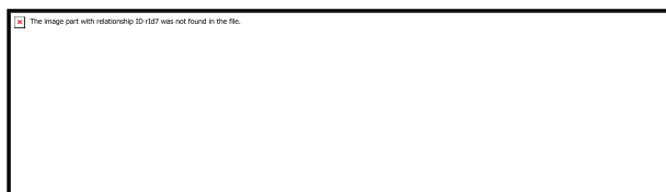
Fig. 1: Country IT-Enabled Services Export in 2006

Information and communication technology (ICT) has been found to be a key player in making IT and IT-enabled services of many countries tradable, causing a faster average annual growth in their economy [1]. Many of the developing and developed countries such India, Ireland, Hungary, the Russian Federation, Switzerland, Poland, Denmark, China, Singapore, Finland, Sweden and Spain achieved an annual growth of 15% or more from the exportation of IT and IT-enabled services as of the year 2006 which added to their economic growth [2] as shown in Figure 1.