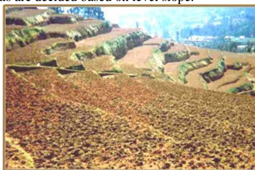
Fig-6: A Image of Bench Terracing System

It helps to bring sloping land into different level strips to enable cultivation. It consists of construction of step like fields along contours by half cutting and half filling. Original slope is converted into level fields. The vertical & horizontal intervals are decided based on level slope.