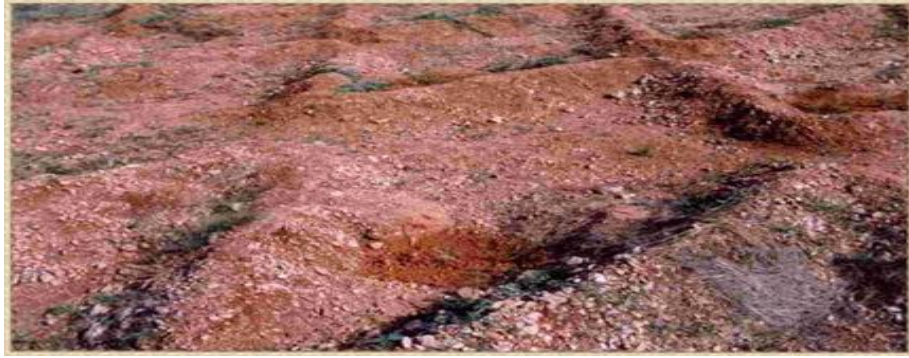
Fig-7: A Image of Micro catchments for Sloping Lands System