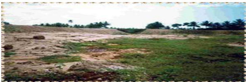
Fig-9: A Image of Percolation Pond System