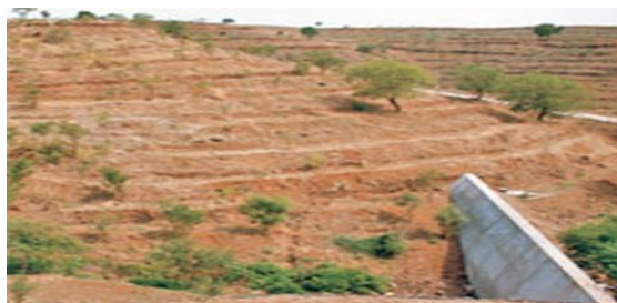
Fig-5: A Image of Contour Bund System