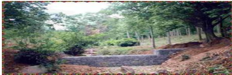
Fig-8: A Image of Cheek Dam System