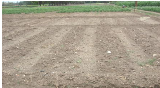
Fig-3: A Image of Broad Beds System

To control erosion and to conserve soil moisture in the soil during rainy days. The broad bed and furrow system is laid within the field boundaries. The land levels taken and it is laid using either animal drawn or tractor drawn ridge's