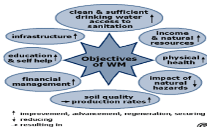
Fig-1: Model of Objectives for watershed management