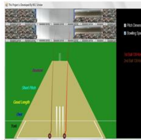
Fig 03 (Two Yorker Delivery with different properties)