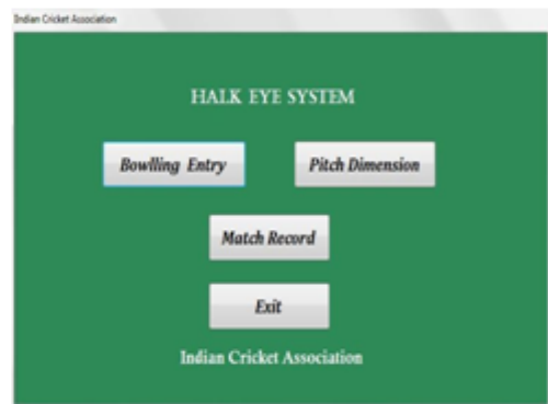
Fig 01(Input Format for Analysis)

Figure 3:- Shows Two York Delivery with different properties where Red path indicates minimum deviation of ball and Brown path indicates maximum deviation of ball