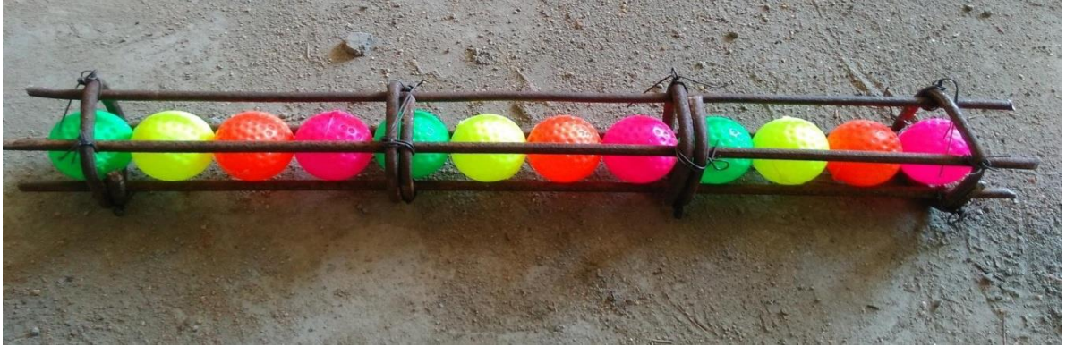
Fig. 2. Bubble lattice