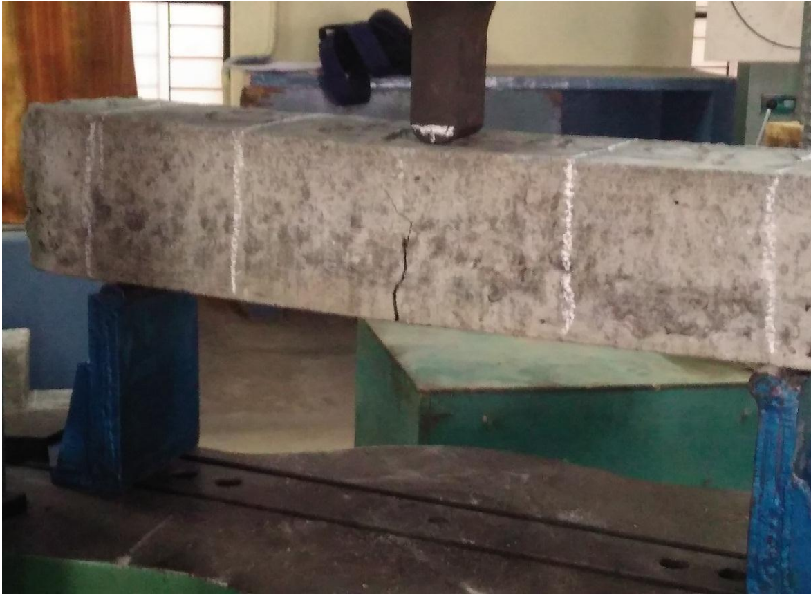
Fig. 6. Crack pattern