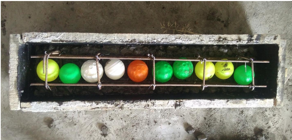
Fig. 3. Bubble lattice placed in concrete