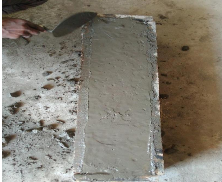
Fig.5.Finishing of Surface

After making beam specimens, they were left for curing for 28days at curing tank.