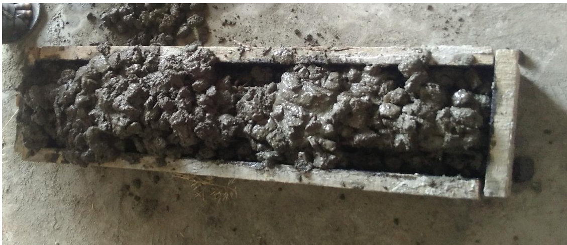
Fig. 4. Pouring of Concrete